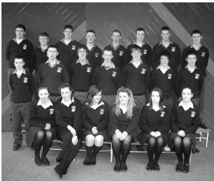
Transition Year Class-