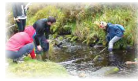
Leaving Cert Geography students carrying out their field study, a study of river erosion, on the River Silles in County Fermanagh.