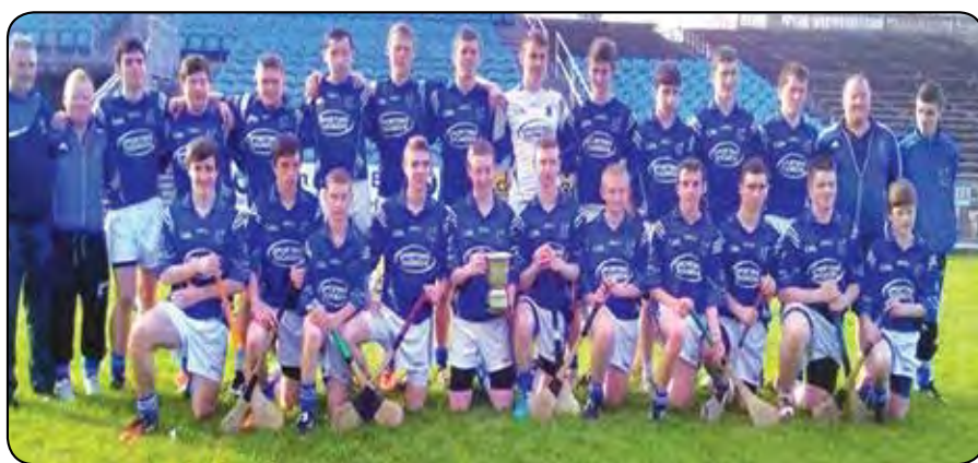
Pictured is the Tooreen U-16 squad who won the Connacht 'A' Hurling Championship.